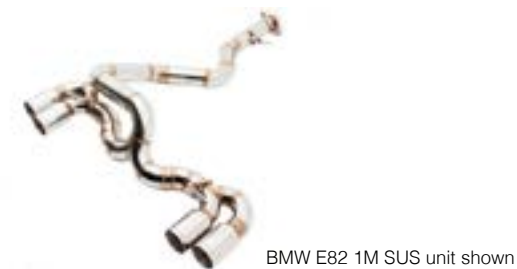
BMW E82 1M SUS unit shown

T304/T316 high grade polished stainless steel from POSCO. Durable, corrosion resistant. Perfect for the everyday driver.