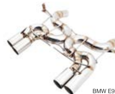
BMW E9X M3 SGT unit shown

SGT (Super GT – Track Performance) is intended for the diehard type. Simply put, this system is for the purist: the simplest and lightest format of exhaust system which is suitable for racing type applications. For Super GT exhaust development, our engineers went back to the drawing board, focusing solely to create a system that is the lightest in weight and delivers maximum performance gain. Utilizing extremely free-flowing designs in all aspects, our Super GT exhaust systems were created and intended for race track use. The Super GT is the best performing Meisterschaft exhaust. Sound level 9/10 (Racing type)