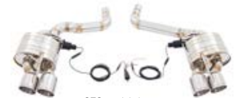
GTC model shown

GTC (EV Control) Utilizing our E.C.V.C (Electronically Controlled Variable Chamber) technology, the Meisterschaft GTC uses an electronic valve system to control the volume and tone of the exhaust system at the users will. In the fully open position, the Meisterschaft GTC provides the most exotic, aggressive exhaust note similar to conventional GT2 systems we have offered. When in the closed position the GTC system will produce a sound comparable to OEM. The Meisterschaft GTC provides the best of both worlds.