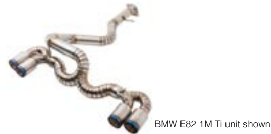
BMW E82 1M Ti unit shown

100% Premium titanium alloy. Extremely lightweight, highly recommended for track & racing applications