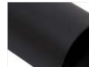
MATTE BLACK Matte Powder Coat Finish