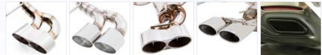
CR Connected Round SR Separated Round CO Connected Oval SO Separated Oval OE Utilizing OE Tips (Built into the bumper)

Depending on the vehicle application, several different tip styles are offered to suit each customer's individual taste. Optional finishes are also available for further customization.