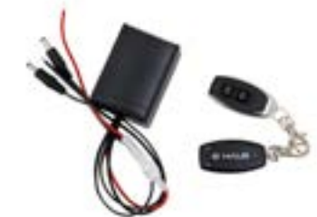
Wireless Remote Control unit shown

For additional convenience, we offer an option to replace the included hardwire switch for the GTC (EV Control) system with a wireless control module and key fob remotes. We offer two variations of wireless control: Momentary Action (press and hold to control) or One Touch Action (one-click to achieve fully-open or fully-closed position).