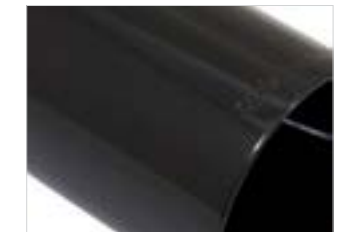
GLOSS BLACK High Gloss Powder Coat Finish