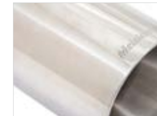
STANDARD FINISH POLISHED STAINLESS STEEL