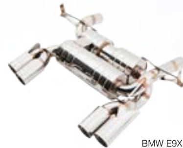
BMW E9X M3 GT unit shown

HP (Touring Performance) is moderate sounding and the least aggressive system offered in the Meisterschaft line, still yielding solid performance gains and a subtle yet noticeable increase in exhaust tone over the OEM system. Formulated for a mature crowd, the HP system creates a great tone but remains non-intrusive – perfect for daily driving. Sound level 4/10 (Moderate) **NOTE: OEM Exhaust Sound level being 2/10