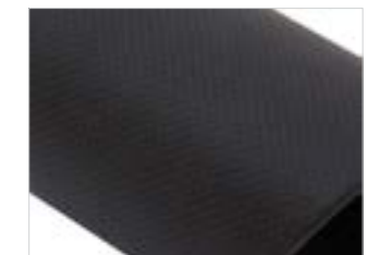
CARBON FIBER Heat Baked Dry Carbon