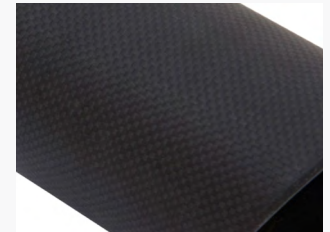
CARBON FIBER Heat Baked Dry Carbon