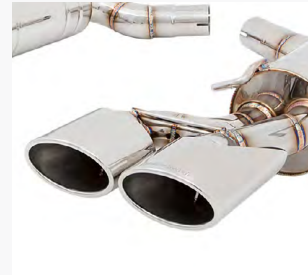
SO Separated Oval