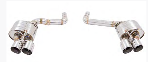
GTS model shown

GTS (Ultimate Performance) provides an exotic & aggressive exhaust note as well as ample performance gains across the board; the GTS is the perfect choice for those looking for a straight forward – install and go exhaust system. The Meisterschaft GTS does not feature valve control.