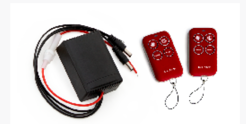
Wireless Remote Control unit shown

Upgrade your GTC-EV (Electric Valves) system with a wireless remote solution that replaces the standard hardwired toggle switch. Wireless Remotes come equipped with both convenient one-touch and momentary operation, putting you in control of partial to wide open valve settings. This package includes a 12V Receiver and Two Key Fobs.