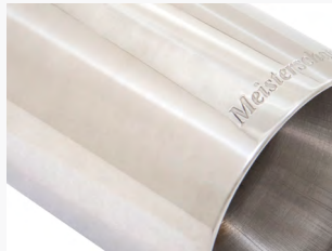
STANDARD FINISH Polished Stainless Steel