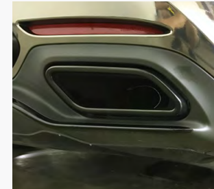
OE Utilizing OE Tips (Built into the bumper)