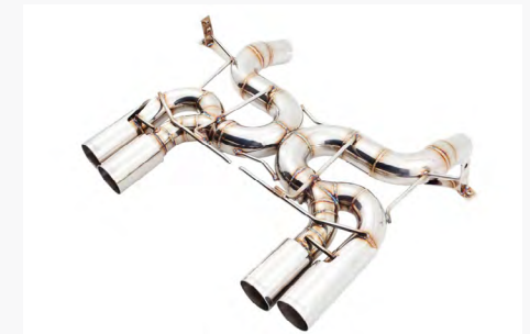
BMW E9X M3 SGT unit shown