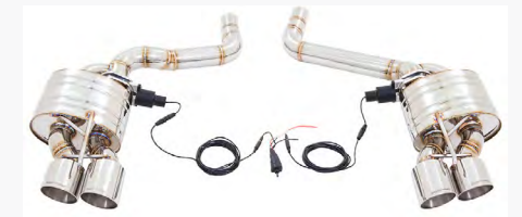
GTC model shown

GTC (EV Control) Utilizing our E.C.V.C (Electronically Controlled Variable Chamber) technology, the Meisterschaft GTC uses an electronic valve system to control the volume and tone of the exhaust system at the users will. In the fully open position, the Meisterschaft GTC provides the most exotic, aggressive exhaust note similar to conventional GT2 systems we have offered. When in the closed position the GTC system will produce a sound comparable to OEM. The Meisterschaft GTC provides the best of both worlds.