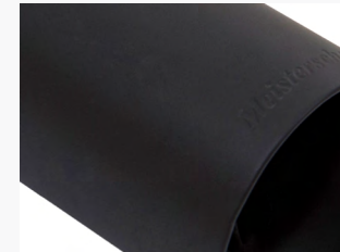
MATTE BLACK Matte Powder Coat Finish