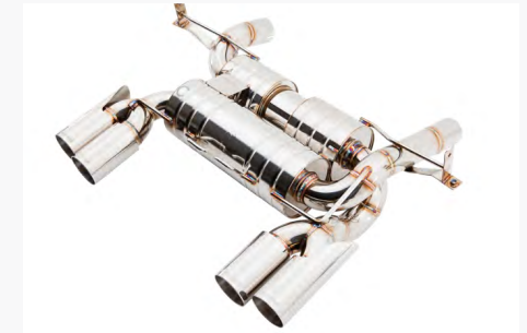
BMW E9X M3 GT unit shown