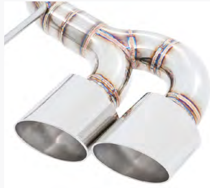
SR Separated Round

Depending on the vehicle application, several different tip styles are offered to suit each customer's individual taste. Optional finishes are also available for further customization.